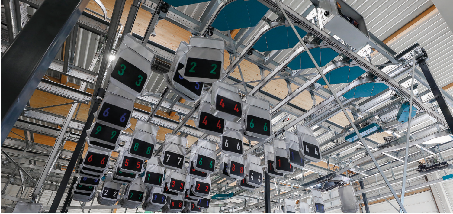
From random to perfect order in three steps

Each standard BG Pouch System module can be configured to provide minimal touch for order fulfillment and returns handling within a single system. The BEUMER AutoDrop functionality further enhances this by automating the unloading process, ensuring gentle product handling and reducing the number of touches even further.