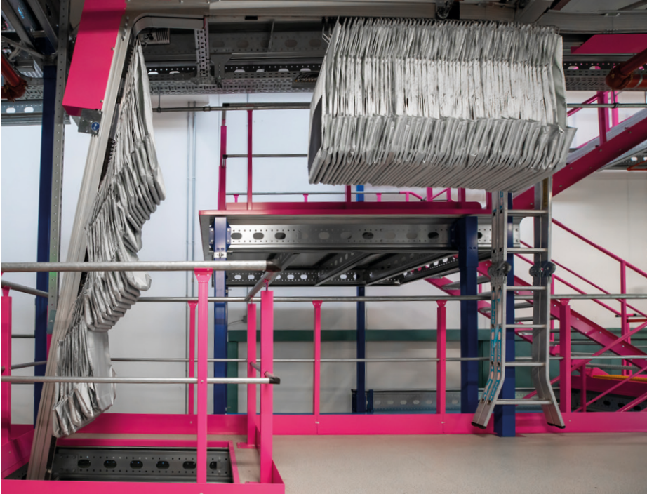
Gentle handling and complete system overview – also in when moving between heights